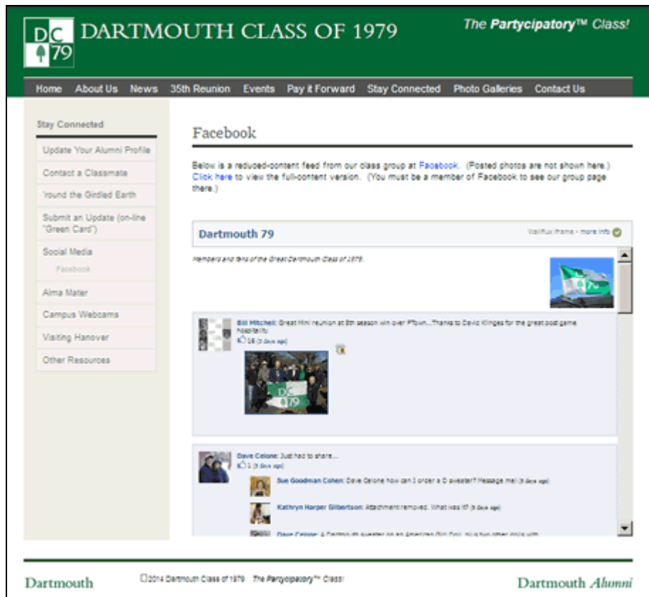
Class of '79 Facebook Group-Wall embedded in iModules page

Wallflux iframes embedded with a width of less than 500 pixels are designed to automatically hide the top demonstration notice because of space constraints. Wallflux iframes are transparent, allowing you to define your own background color or image.